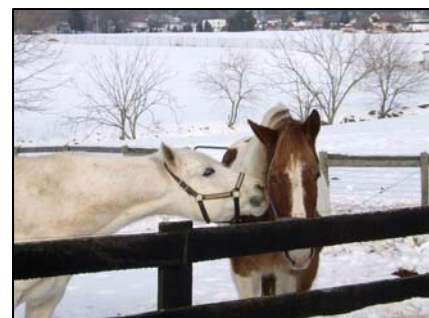
RiverBoy telling Bud all about the Big Barn Dance

Contact Marcie Van Splinter at 717.989.4995 to reserve your tickets.