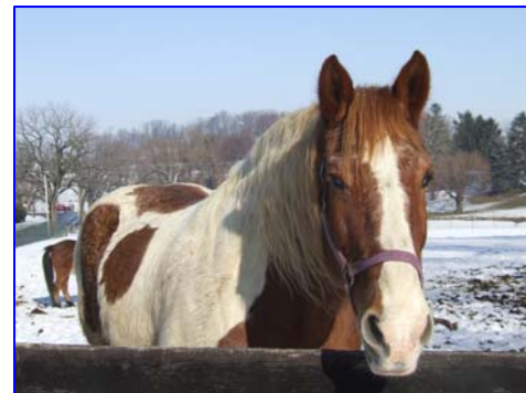
Bud hanging out in the snow