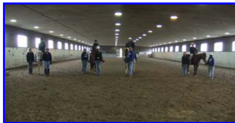
Clinic participants at the February 9 th clinic

continue working with volunteers to develop and build skills. You will see colored dots on nametags this year that indicate levels of leading (green), side walking (red) and horse handling (blue). This adds to the knowledge base of volunteers and the safety of our program overall. Please talk to Sandi or Patti for more information.